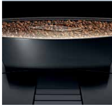
Professional ceramic disc grinder