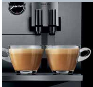
Variable dual spout with 2 coffee spouts and 2 milk spouts