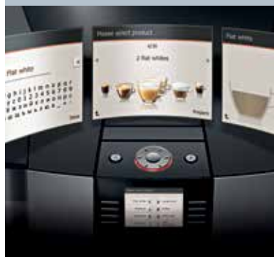
Customisable start screen