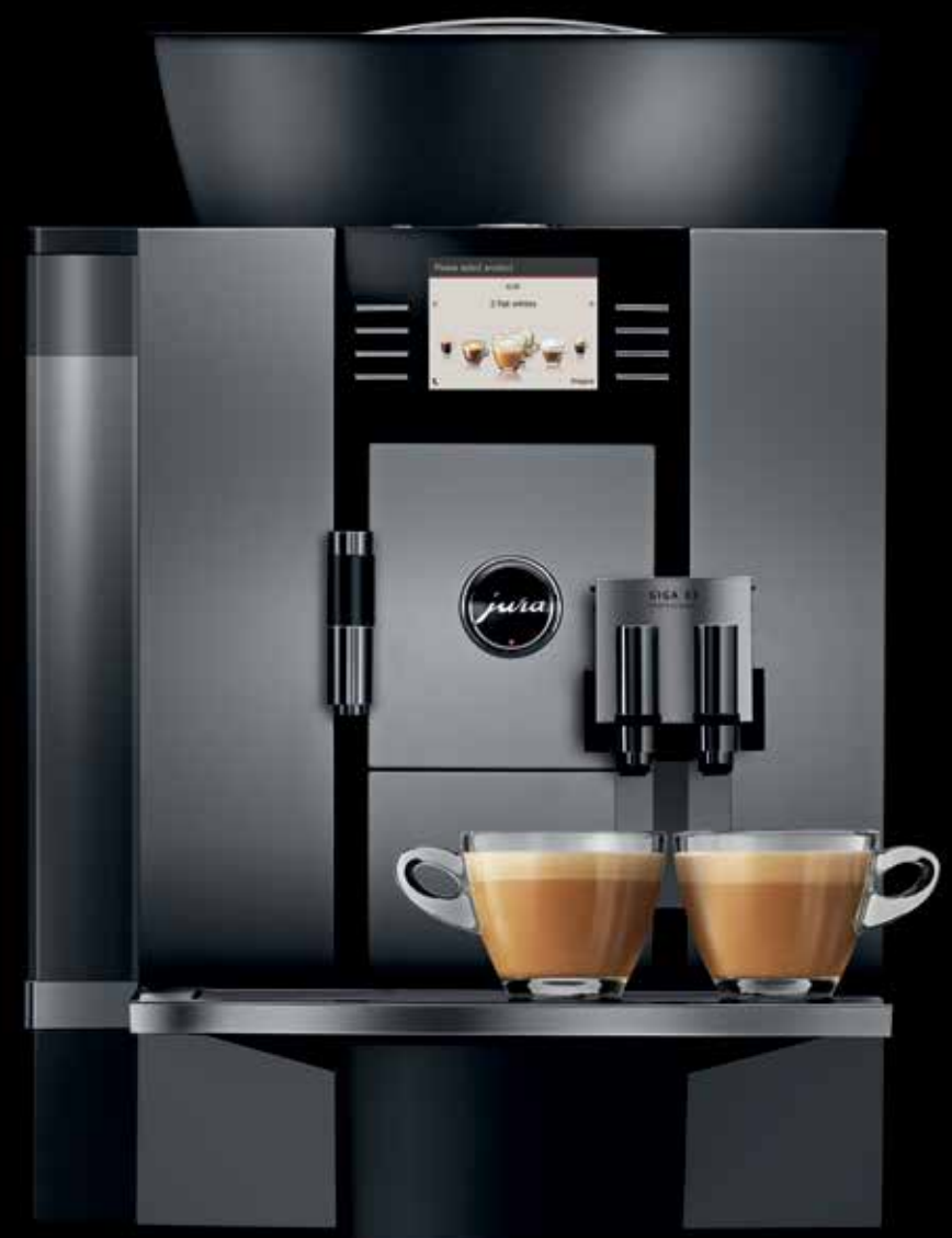
GIGA X3 Professional

With a wide selection of accessories including a cup warmer, milk cooler, coffee grounds disposal function set, drip drain set and interface for accounting systems, as well as an attractive range of storage and presentation units, it is possible to create a complete coffee solution tailored to your specific requirements.