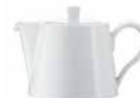
A pot of coffee (360 ml) 2 minute 33 seconds